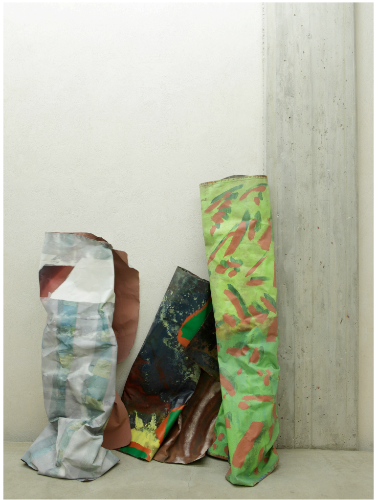
ELEPHANT TALK exhibition view at CAR drde, 2013

Andrea Kvas "Untitled" 2013, cotton, bleach, fabric dye, water-based paint, acrylic resin, pigments, shellac (installation view)