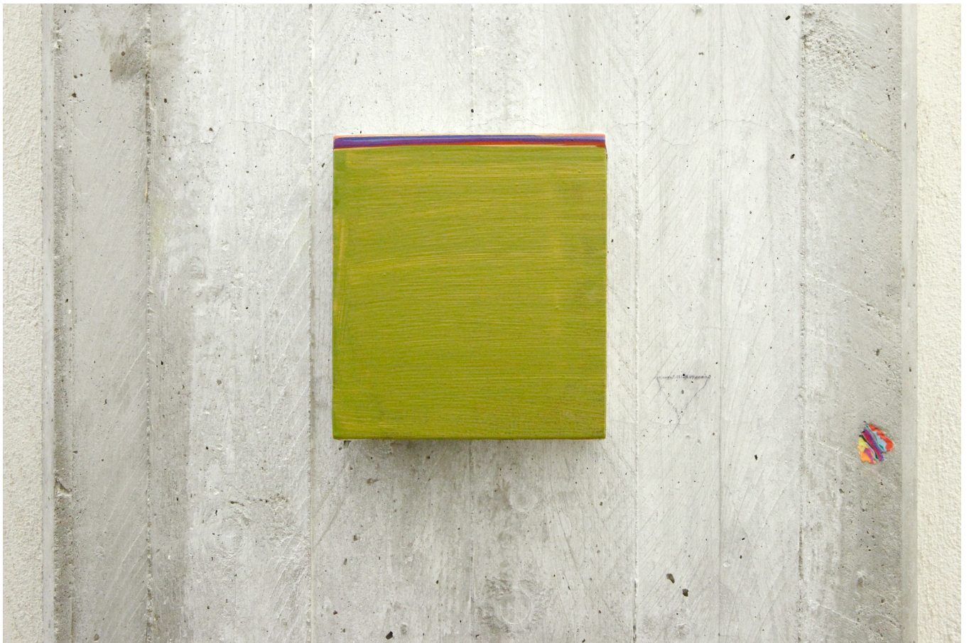
ELEPHANT TALK exhibition view at CAR drde, 2013