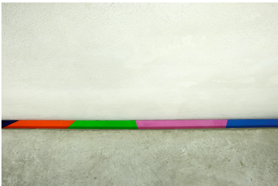
ELEPHANT TALK exhibition view at CAR drde, 2013

Nicola Melinelli, oil on linen 2013 Nicola Melinelli, oil on canvas (installation detail)